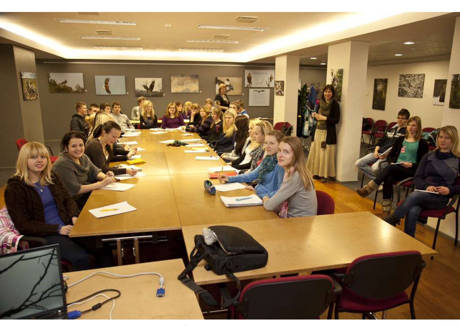
Biology lecture about eagles for Põlva Ühisgümnaasium in exposition place