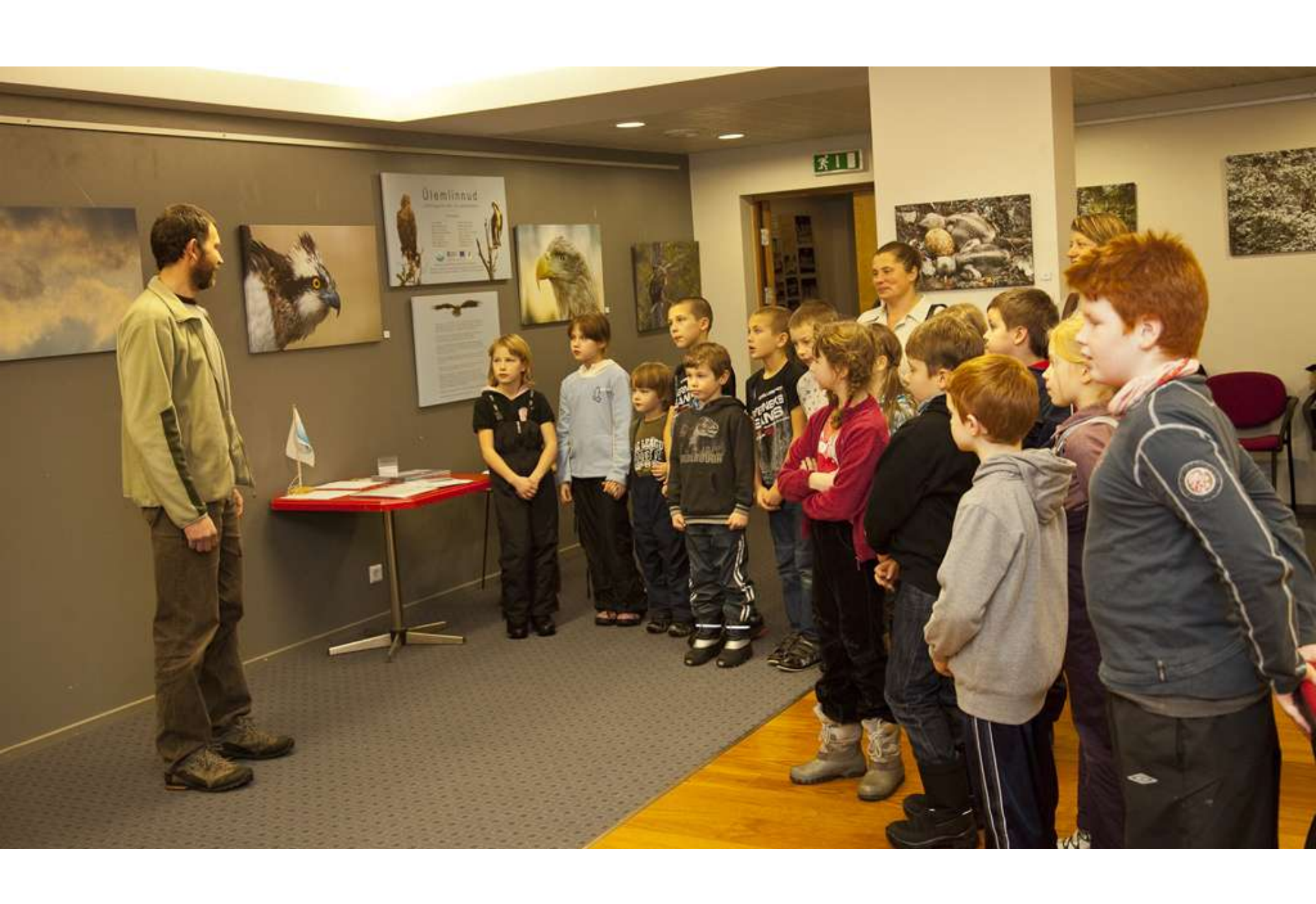
Himmaste Algkool at exposition place in Põlva