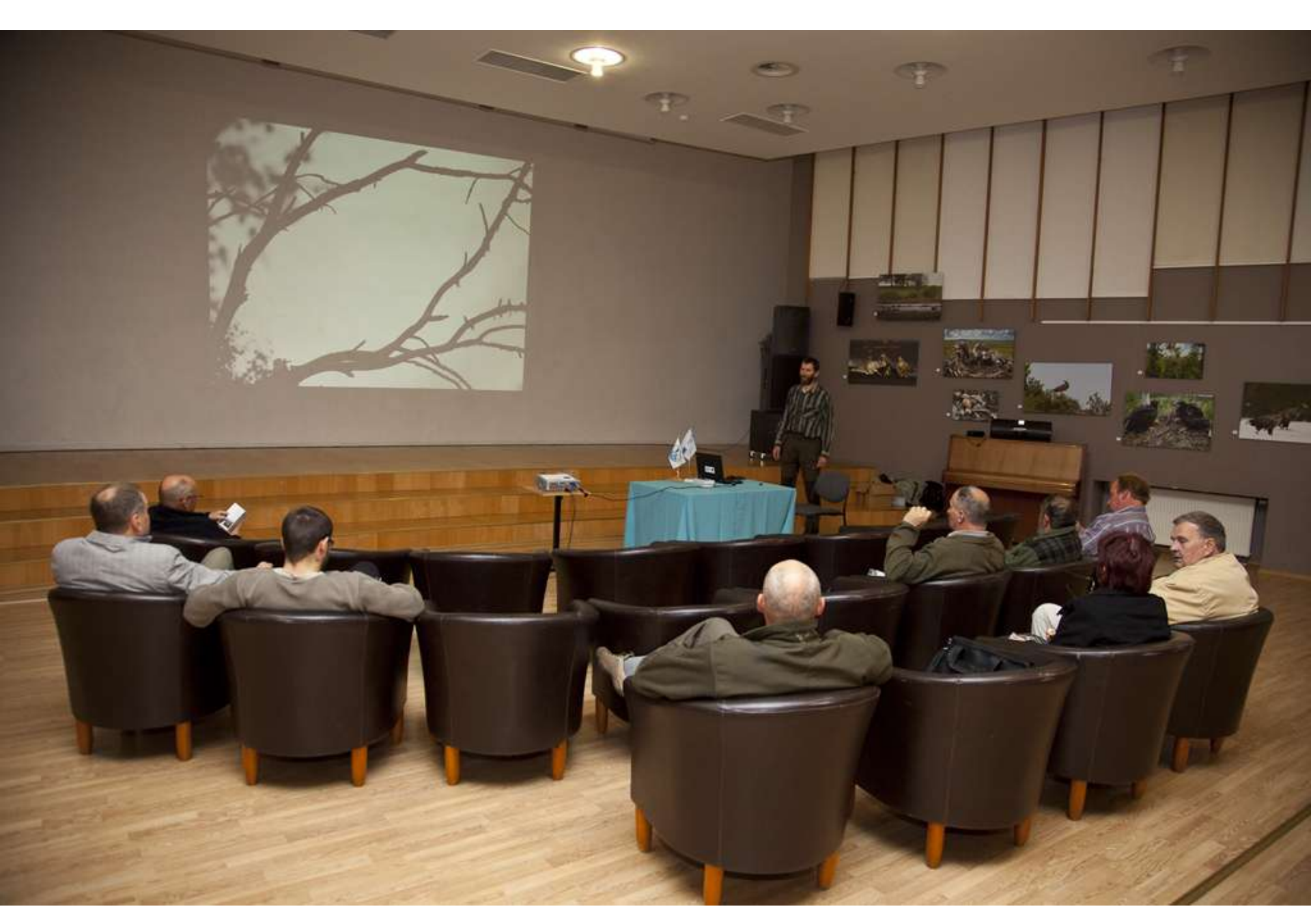
Privat forest owners in Valga, just couple of days before final event