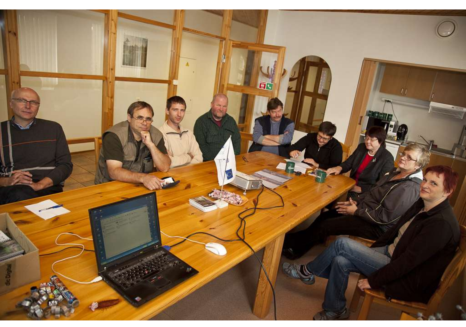
State foresters in Räpina, in room part of the seminar